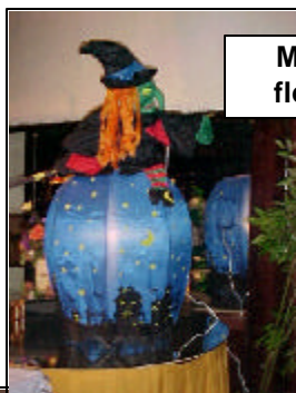
Mystery guest who flew in for the party

NEXT PARTY NOVEMBER 18 at the AMBER HOUSE Lesson 3 PM Dance Party 4PM-8PM Our parties are at the Cabaret Ballroom located inside 'The Amber House, 7012 E Nine Mile Road, Warren, MI. 810-754-3434